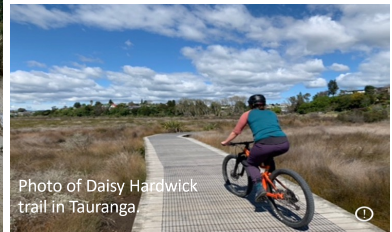
Photo of Daisy Hardwick trail in Tauranga.